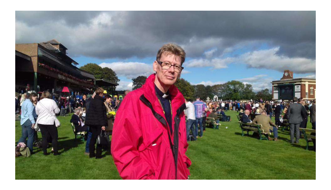
Horse Racing & the Church?

When I first told people that I was going to be a chaplain at the race course in Ripon I had some different reactions, some positive and some negative. What on earth is a Minister doing wandering around a racecourse watching people gamble!