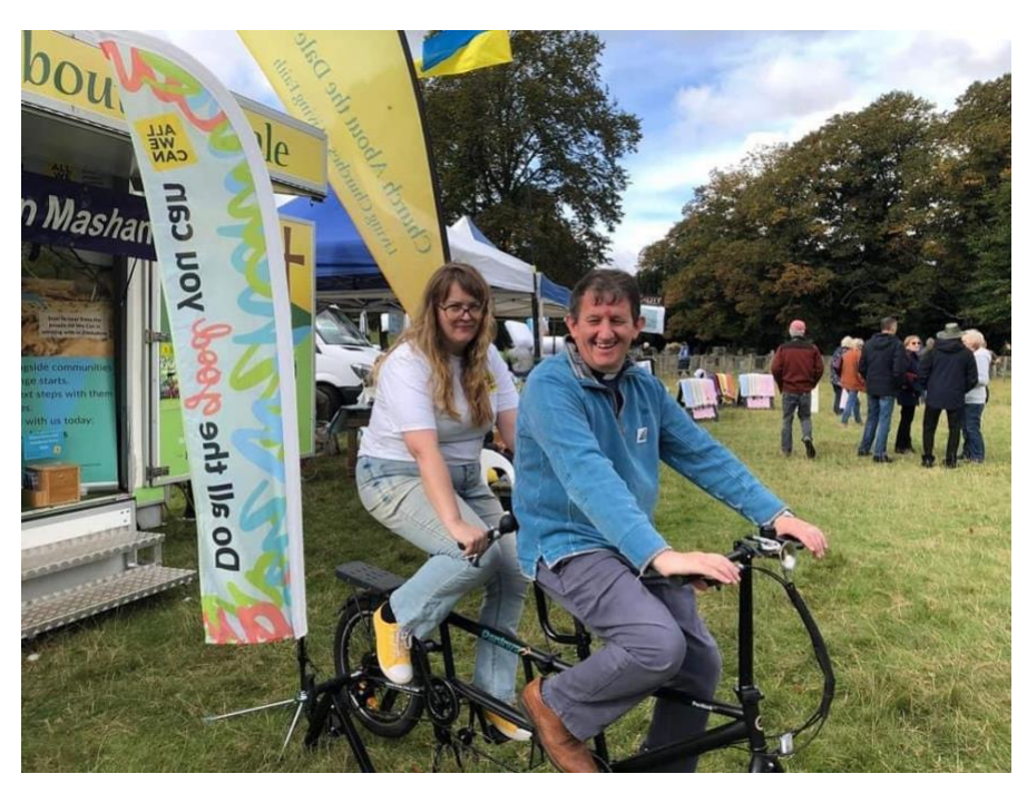
Is this the new form of Circuit Transport???